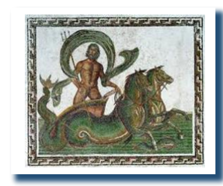
Third century mosaic of Neptune

Mosaic is an art form consisting of composing an image with pieces of glass, stone, or other materials.