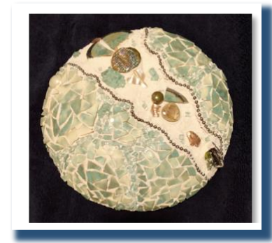
Fissure 2, Diane Elliott

philadelphias-magic-gardens/about-isaiah-zagar/