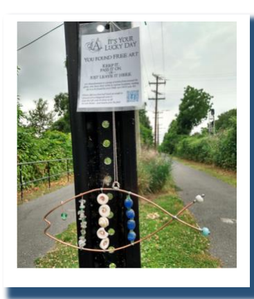
One of my first acts of art abandonment