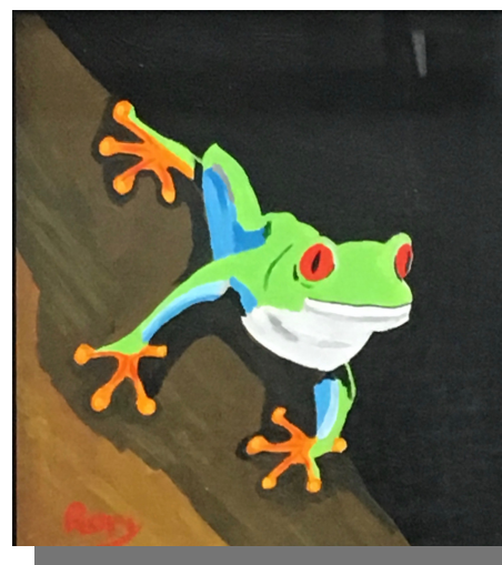
Frog, acrylic on paper