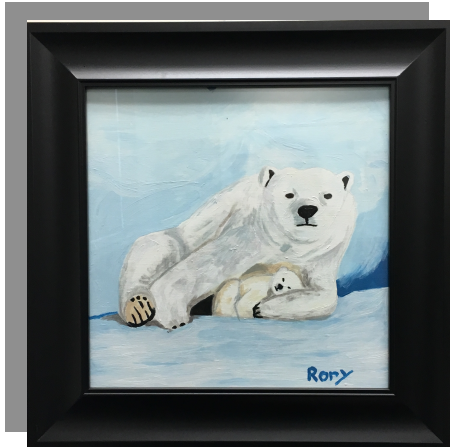
Polar Bear, acrylic