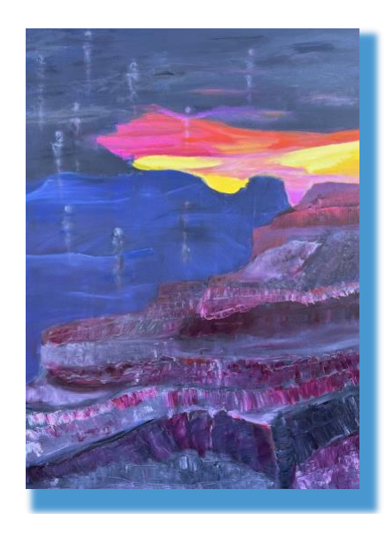
Canyon Spirit, by Delia Mychajluk

A useful definition of Eco Art is provided on the website of Artterra: "Eco art is a type of art that explores ecological issues, climate change, and natural phenomena. Eco artists often use natural materials and sustainable practices to create works that activate change and draw attention to environmental situations."