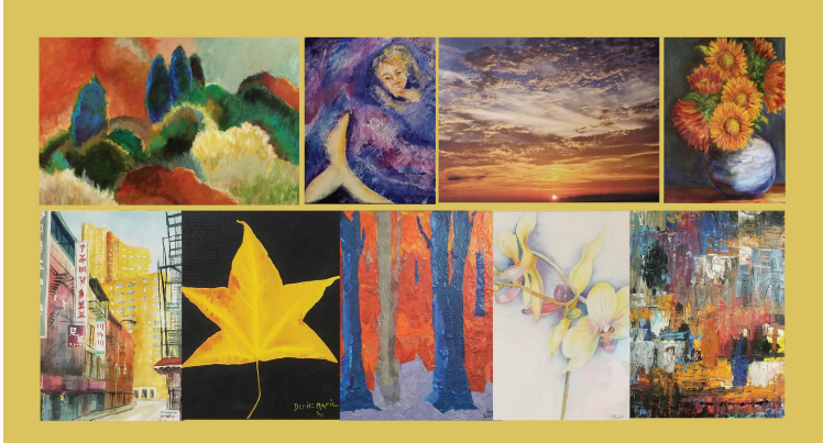
October 27, 2018 to January 26, 2019

The annual HCAA meeting will be Sunday, January 20, 2-4 PM. Mark your calendars!